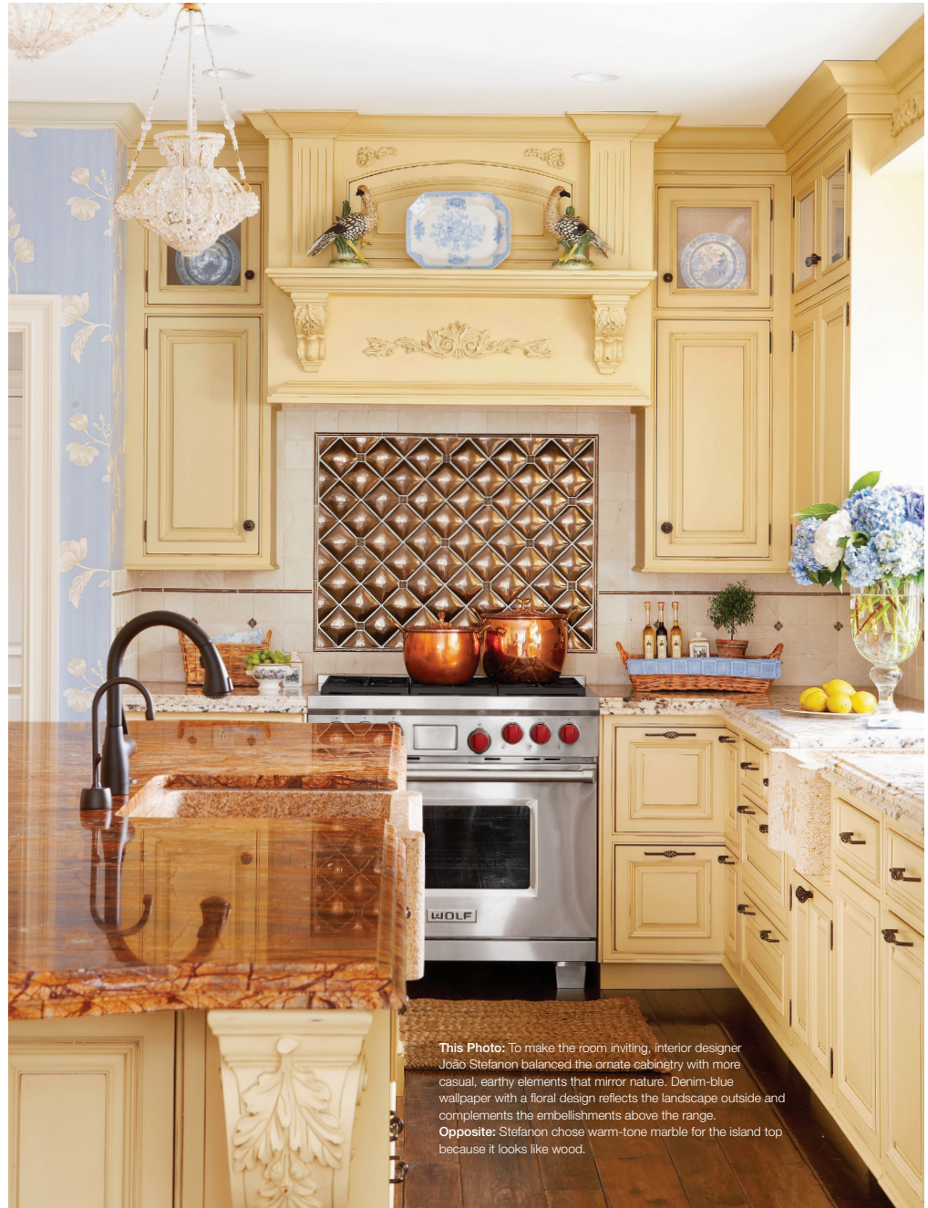
This Photo: To make the room inviting, interior designer João Stefanon balanced the ornate cabinetry with more casual, earthy elements that mirror nature. Denim-blue wallpaper with a floral design reflects the landscape outside and complements the embellishments above the range. Opposite: Stefanon chose warm-tone marble for the island top because it looks like wood.